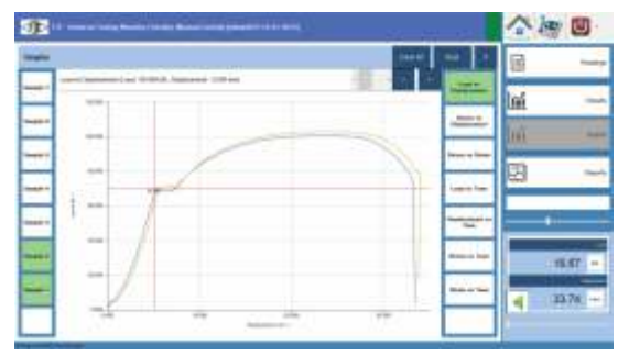
Graph comparison, superimpose of batch sample tests with Graph zooming and point tracing facility.

Graph superimpose, Comparison & point tracing