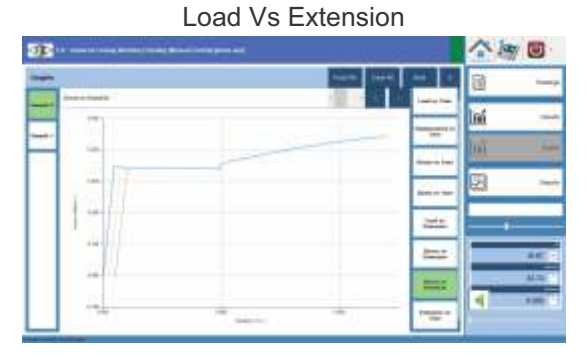
Displays graph for extensometer readings against load with proof lines for proof stress.